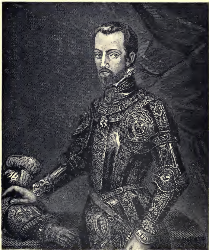
PHILIP THE SECOND.